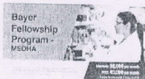
Medha Fellowship.jpeg 262K