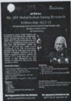
DR Kalam Fellowship 2022-23 (1) (1).png 1182K

PA-PA upload on University website [Signature] 13/10